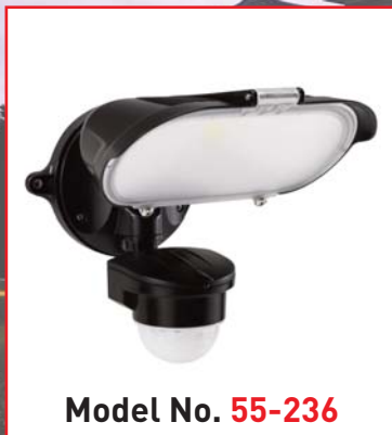
Model No. 55-236